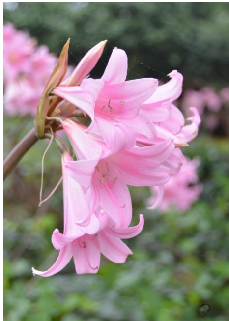
Alice Keck Park Memorial Garden

P.O. Box 1990 Santa Barbara, California 93102 (805) 564-5433 www.santabarbaraca.gov